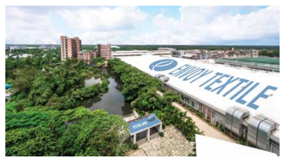
first LEED Platinum certified denim plant.

management to give the premises a green touch everywhere. The company has a dedicated area near the quest accommodation center where exotic birds are kept, including peacocks, macaws, and others. In addition to the birds, Envoy Textilehas also set up a petting area where rabbits are